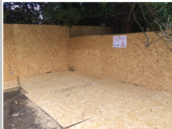
Tree protection Hoarding and ground protection over sharp sand.