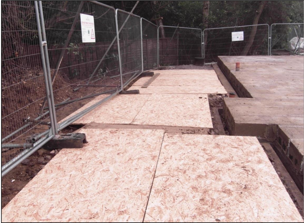
Fig. 1 Ground protection – hoarding over sharp sand and wood chip

Installing heavy-duty OSB boarding over a depth (min. 50mm) of sharp sand and/or wood chip between the tree protection fencing and the foundation line of new development is effective in protecting roots, which grow in the soil beyond the position of the fencing.