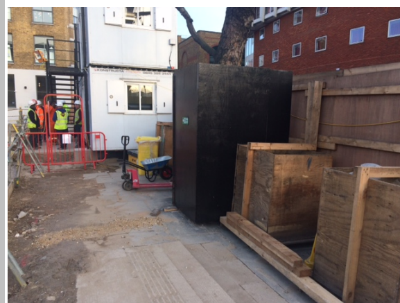
Robust hoarding and temporary concrete ground protection