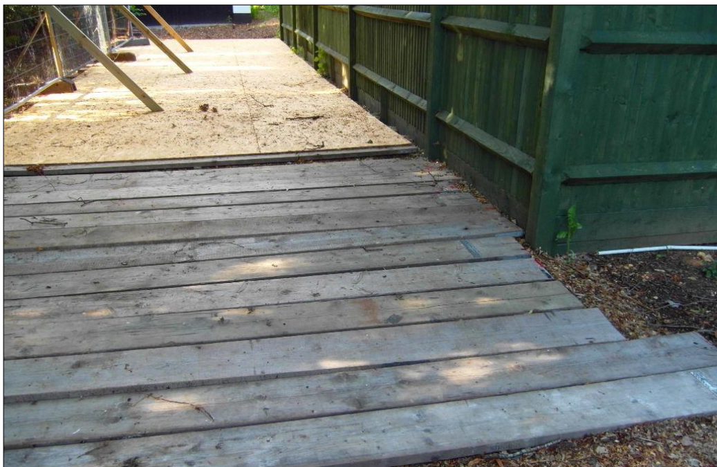
Fig.2 Side-butting scaffold boards and covered and fixed with 20mm OSB boarding

Installing heavy-duty OSB boarding over a depth (min. 50mm) of sharp sand and/or wood chip between the tree protection fencing and the foundation line of new development is effective in protecting roots, which grow in the soil beyond the position of the fencing.